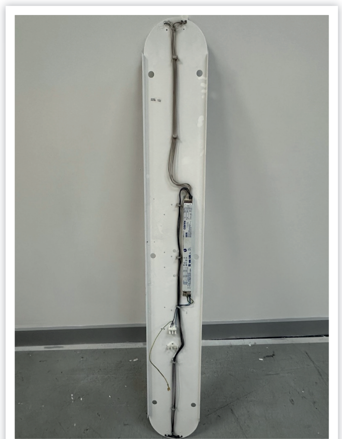
BEFORE - REAR VIEW