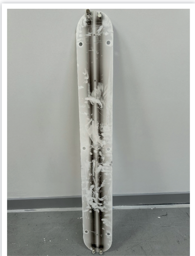
BEFORE - FRONT VIEW

They wanted us to use the existing steelwork and simply remove the T5 Endcaps, ballast and wiring and replace it with LED boards and a driver.