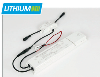
EMERGENCY CONVERSION KIT WITH LITHIUM BATTERY