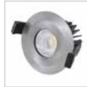
FIRE RATED DOWNLIGHTS