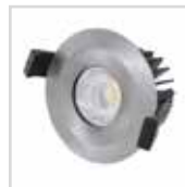
FIRE RATED DOWNLIGHTS